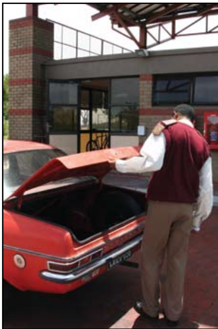
■ Access control vehicle boot search

THE safety and security of students and staff have always been prioritised at UWC.