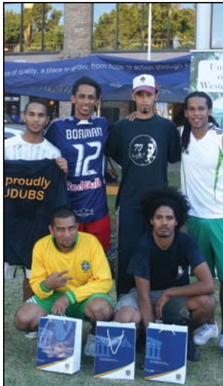
■ Winning team, The Originals