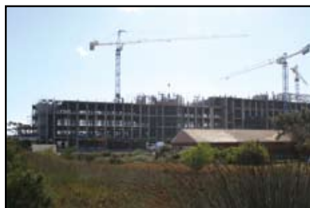
■ The Lifesciences Building being erected

Today, true to its commitment to the to the disadvantaged, UWC provides education of high quality, leads South Africa in several fields of research, and makes a major contribution to the nation’s human resources needs. Remarkably, it achieves this while keeping fees low in response to the socio-economic circumstances of most of its students.