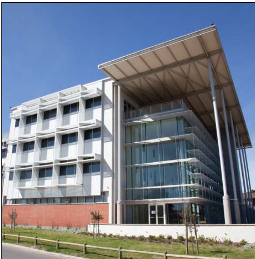
■ The new school of Public Health Building