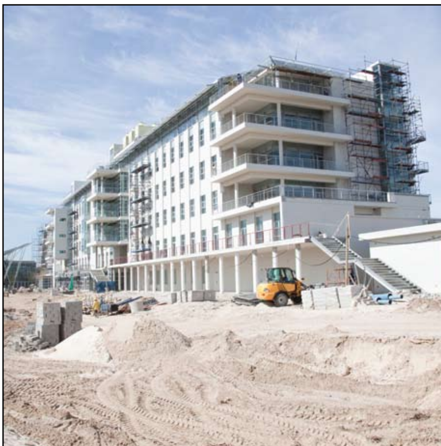
■ The R500-million Lifesciences Building nearing completion in 2009