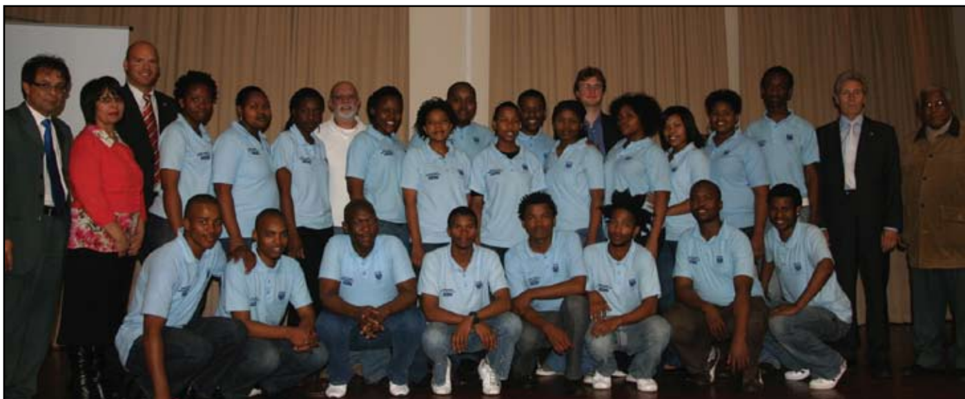
■ The Creative Choir