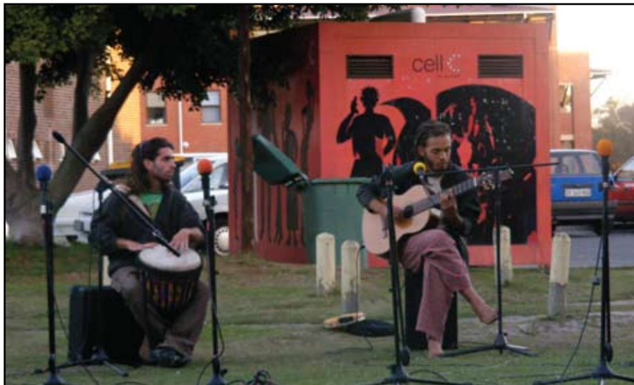
■ Performers at the Residences

The Centre is also always happy to consider presenting the theatre works of individuals seeking a venue, subject to conditions and approval by the Centre management.