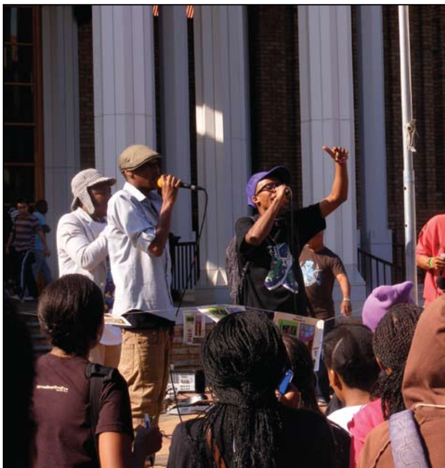
■ Drie Manskap Hip Hop group