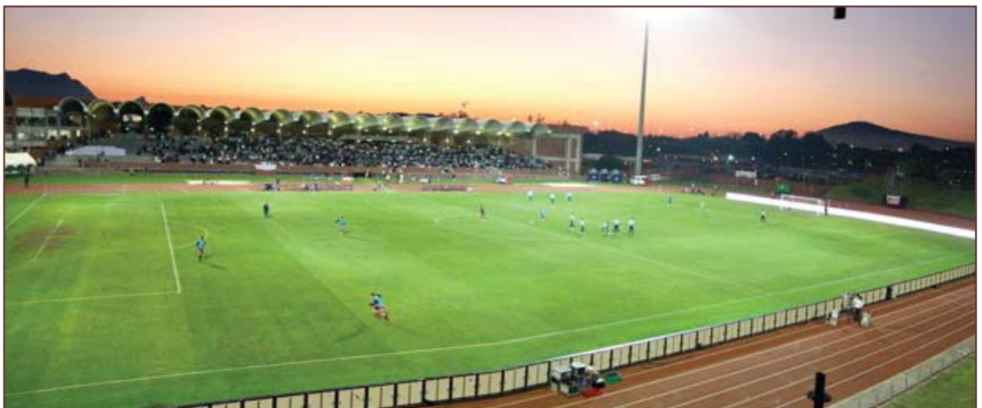
■ UWC sports stadium –the venue for an international friendly between Poland and Iraq in 2009