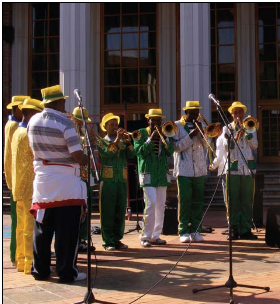
■ Minstrels performing in front of the main hall