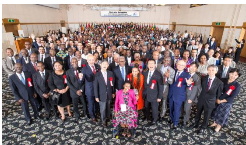
ABE Initiative 4 th Batch Arrival Reception in Japan

SDGs Program was launched in 2019. There are still many challenges to achieve SDs in Africa, it is thus vital to develop human resources that can contribute to tackling the challenges in the respective field through policy decision and implementation.